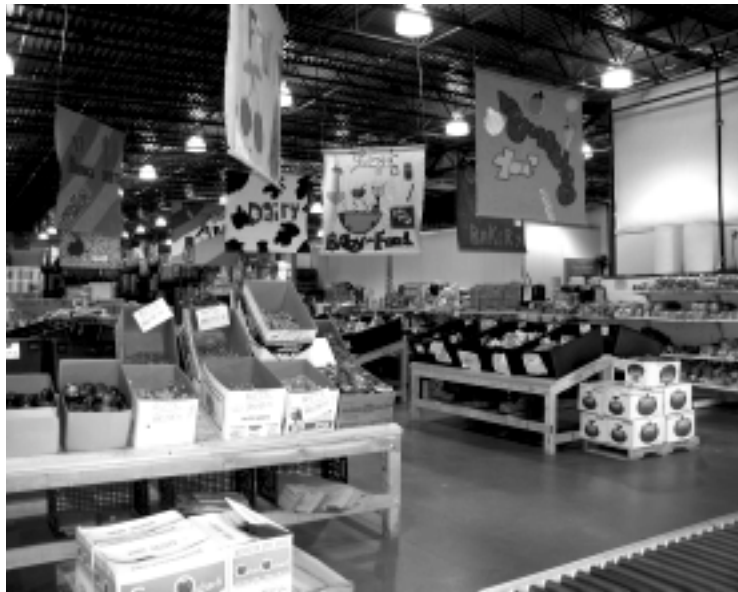
C FS increased food distribution by 40% in 2003.

In order to keep pace with the increasing demand and unmet need we estimate to exist in our community, we plan to further increase our food distribution to 4 million pounds by 2006. But first, our goal for 2004 is to distribute 2.7 million pounds. We are well on our way!